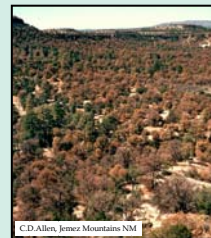
C.D. Allen, Jemez Mountains NM

Natural resource professionals urgently need detailed information on how to manage wildlands and waters under changing climates. The Ecosystem Response Group focuses on available science information related to elevational-gradient studies, disturbance processes (fire, insects, flood), and scale issues, and interprets these within the context of specific planning projects and resource areas.