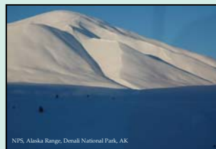
Alaska Range, Denali National Park, AK

CIRMOUNT seeks to improve knowledge of high-elevation climate systems and to integrate knowledge of mountain ecosystem response to climate into natural-resource management and policy.